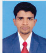
A IQBAL SOGEC SAUDI