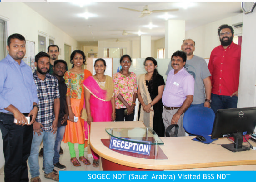
SOGEC NDT (Saudi Arabia) Visited BSS NDT