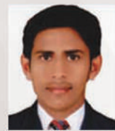
FENJU AXIS SAUDI