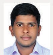
VIBIN A. V. USA