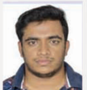
DONA BENNY AXIS SAUDI