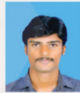
UMESH U. AXIS SAUDI