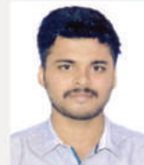
SYAM AXIS SAUDI