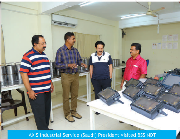
AXIS Industrial Service (Saudi) President visited BSS NDT