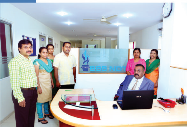
IAO (USA) Team Visited BSS NDT