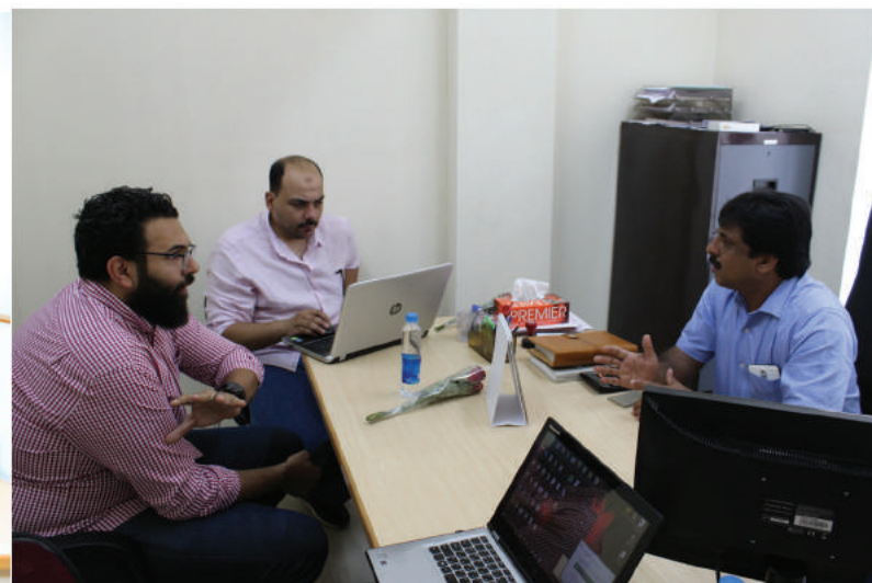
SOGEC (Saudi) Visited BSS NDT

BSS NDT Pvt. Ltd. is proud of its students and this page aim to recognise some of the achievements they have made.